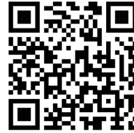
SCAN THE QR CODE TO UPDATE YOUR DETAILS