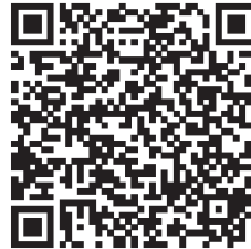
SCAN THE QR CODE TO UPDATE YOUR DETAILS