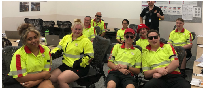
Aviation workers have been building strength across companies. Recently Dnata workers stood together to win a 17.2% pay rise in two years.

Negotiations at Virgin are on their way and your recent participation in the survey has significantly contributed to build our claim in the upcoming bargaining meetings.